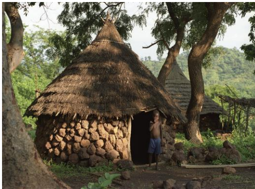
Banjul, the capital of Gambia.

This overnight program provides the unique opportunity to explore Casamance, the renowned southern region of Senegal watered by the winding Casamance River, lush with mangroves and lagoons, and rich in local culture and traditions. You will also be able to cross borders and visit